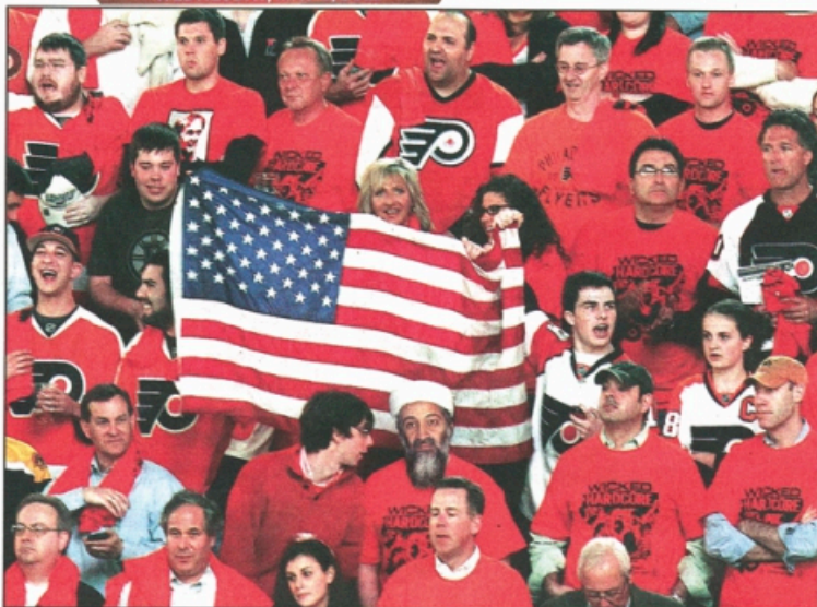
TORONTO SUN PHOTO ILLUSTRATION

The Toronto Sun ■ WEDNESDAY, MAY 4, 2011