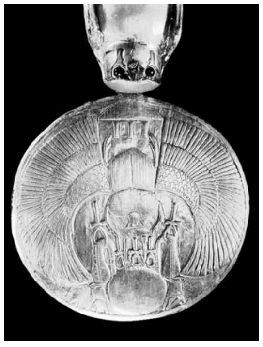
NOT THIS SIDE UP...